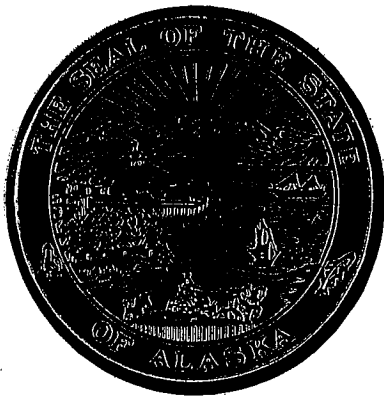
SEAN PARNELL LIEUTENANT GOVERNOR