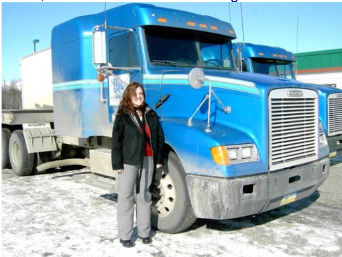
STEP, Commercial Drivers Training