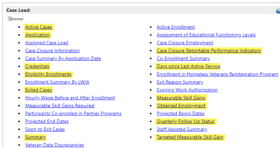
Figure 1 Case Load Reports Menu

Report descriptions and samples for report titles in yellow highlight follow.